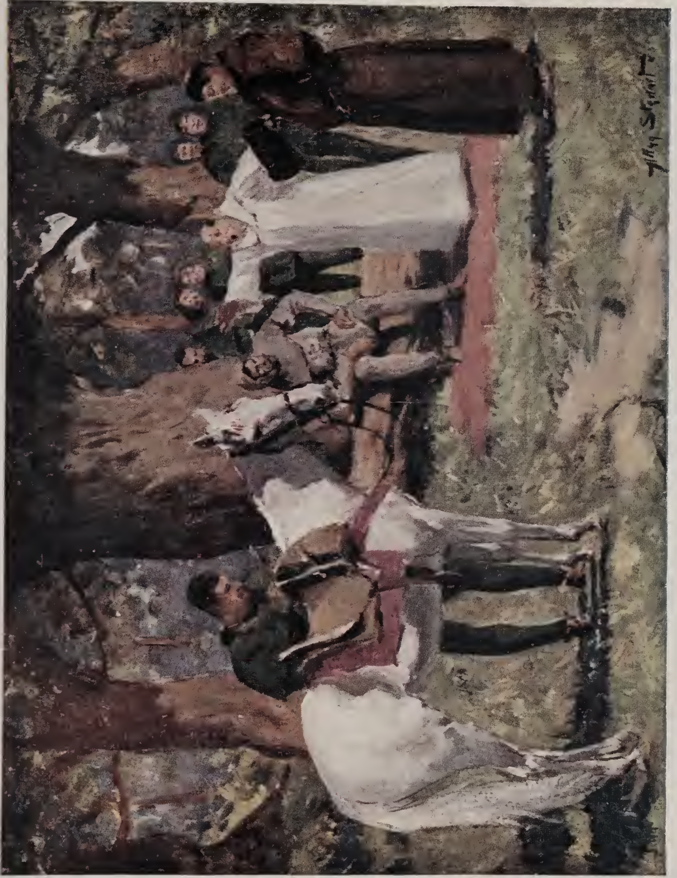
THE WORTHY BISHOP FOUND HIMSELF A PRISONER.